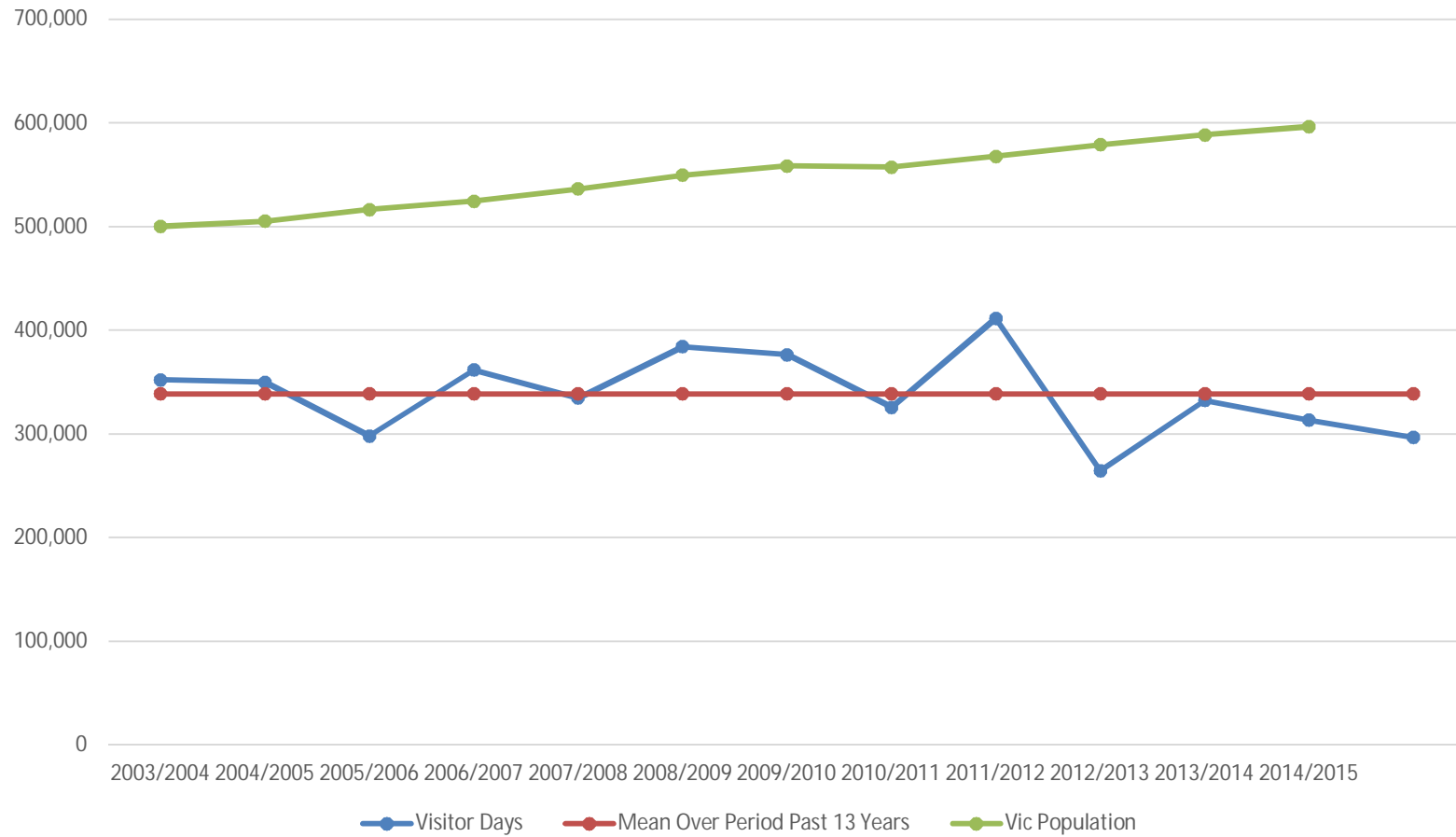
Visitors with Population Growth