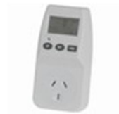
Multifunction Energy Meter $20

And finally, we encourage every club to appoint an "Energy Detective" to their maintenance team. Go through your lodge room-by-room with a fine tooth comb, sniffing out and accounting for all your consumption. You will discover many things that either don't need to be running, can be turned down, run less often or run during off-peak times. You will be staggered by the consumption of some appliances – some may be costing more to run even in a year than replacing with more efficient alternatives. An excellent reference for checking appliance energy ratings is http://www.energyrating.gov.au/ . To facilitate this, we offer a couple of plug-in power meters for checking individual appliances and a "Watts Clever" standby power override. And don't forget to factor in future power pricing (rising more like a "Purgatory Spur" profile than "Easy Street")!