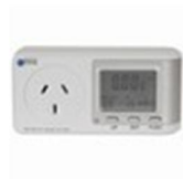
Deluxe Power Meter $30