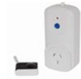
"Watts Clever" Standby Override $40

The Multifunction Energy Meter ($20) is the minimum tool for measuring power (watts) and consumption over time - energy (kWh). Maximum appliance rating is 10 Amps. For the technically minded, it will also measure current (A), frequency (Hz), power factor (pf) and can be programmed with tariffs to display energy cost.